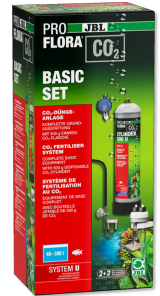
JBL PROFLORA CO2 BASIC SET U CO2 fertil. system basic compl. set f. aquarium plants