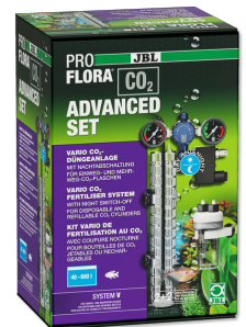
JBL PROFLORA CO2 ADVANCED SET V CO2 system (NO BOTTLE!) with gauges & solenoid valve