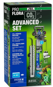
JBL PROFLORA CO2 ADVANCED SET M CO2 plant fertilis. system compl. set+night switch-off