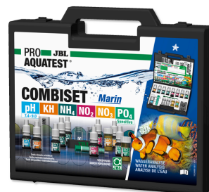
JBL PROAQUATEST COMBISET Marin Test case for water analyses in marine aquariums