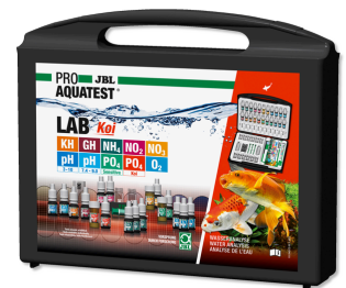
JBL PROAQUATEST LAB Koi Professional test case for koi and garden ponds