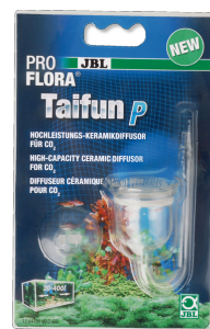
JBL PROFLORA Taifun P Mini CO2 diffuser for nano freshwater aquariums