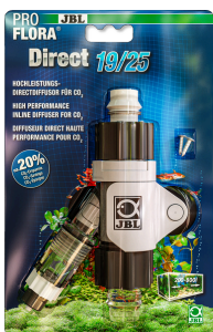
JBL PROFLORA Direct High performance direct diffuser for CO2