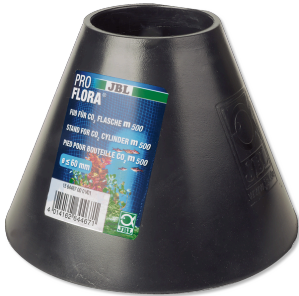
JBL PROFLORA stand CO2 storage cylinder 500 g

Stand for cylinders of CO2 fertiliser systems