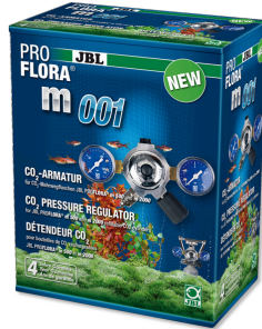
JBL PROFLORA m001 Fitting to reduce pressure

Stand for cylinders of CO2 fertiliser systems