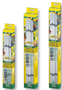
JBL SOLAR Reflect T5/ T8 - 895-1500 mm Reflector panel for fluorescent tube