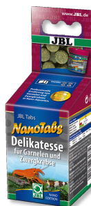
JBL NanoTabs Main food for shrimp and dwarf crayfish