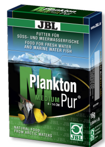
JBL Plankton Pur MEDIUM Treats for large aquarium fish