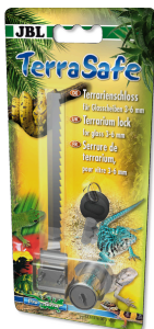
JBL TerraSafe Lock for terrarium pane