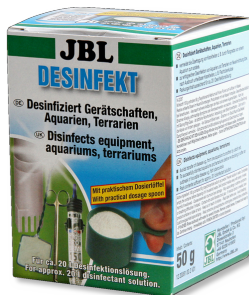
JBL Desinfekt Disinfettante per acquari