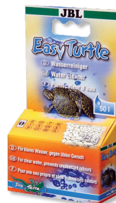
JBL EasyTurtle Special granulate to remove odours