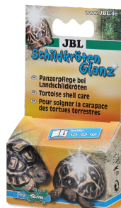
JBL Turtle Sun Glanz Shell care for tortoises