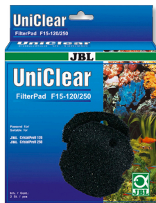
JBL FilterPad F15 Coarse foam pad for aquarium filter CristalProfi