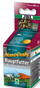
JBL NanoCrabs Main food for dwarf crayfish