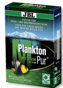
JBL PlanktonPur MEDIUM Treats for large aquarium fish