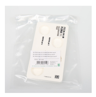
JBL PF CO2 CALIBRATION tray To keep the cuvettes upright during calibration