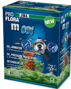
JBL PROFLORA m001 Fitting to reduce pressure

Stand for cylinders of CO2 fertiliser systems