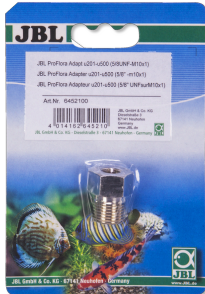
JBL PROFLORA Adapt u201-u500 Adapter for pressure reducer u201