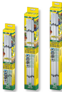
JBL SOLAR Reflect T5/ T8 - 895-1500 mm Reflector panel for fluorescent tube