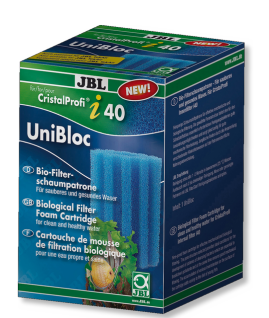
JBL CP i40/TekAir UniBloc blue Foam cartridge for Cristal Profi i40 and TekAir