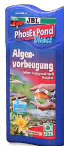
JBL PhosEX Pond Direct Phosphate remover for ponds