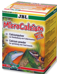
JBL MicroCalcium Mineral supplementary food for all reptiles