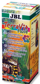
JBL TerraVit fluid Vitamins and trace elements for terrarium animals