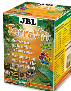
JBL TerraVit Powder Vitamins and trace elements for terrarium animals