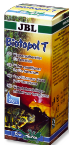
JBL Biotopol T Water conditioner for terrariums