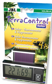
JBL TerraControl Solar Solar-powered thermometer + hygrometer for terrariums