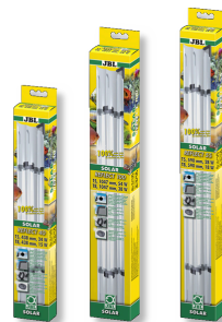
JBL SOLAR Reflect T5/ T8 - 895-1500 mm Reflector panel for fluorescent tube