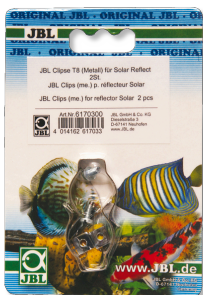
JBL Clips T5/T8 (Metal) Metal holder for fluorescent tubes