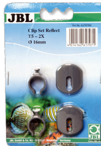
JBL SOLAR REFLECT Clip Set Holder for fluorescent tubes