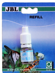
JBL pH Test 7.4-9.0 pH test in aquariums and ponds in the range 7.4-9.0