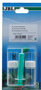
JBL component set for water tests