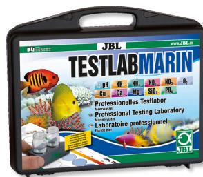
JBL Testlab Marin Professional test case for the analysis of saltwater