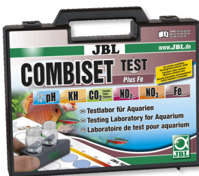
JBL Test Combi Set plus Fe Test case with most important water tests + iron test