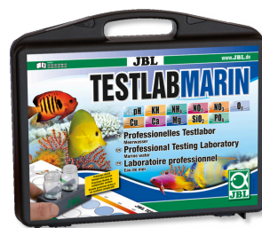
JBL Testlab Marin Professional test case for the analysis of saltwater