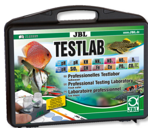
JBL Testlab Test case with 13 tests f. freshwater analysis Testlab