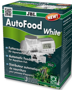
JBL AutoFood WHITE White automatic feeder for aquarium fish