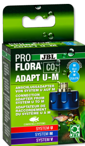
JBL PROFLORA CO2 ADAPT U - M CO2 conversion adapter disposable to refillable bottle