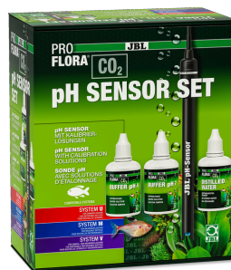
JBL PROFLORA CO2 pH SENSOR SET pH electrode, labor, quality for almost all pH devices