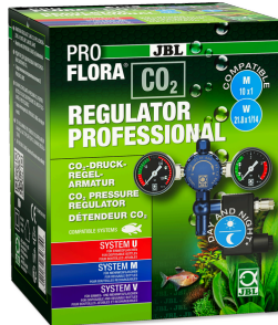
JBL PROFLORA CO2 REGULATOR PROFESSIONAL Pressure regulator with 2 displays & valve for CO2