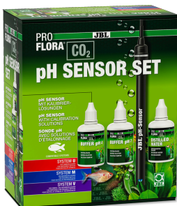
JBL PROFLORA CO2 pH SENSOR SET pH electrode, labor. quality for almost all pH devices