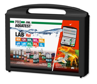
JBL PROAQUATEST LAB Koi

Professional test case for marine water analysis