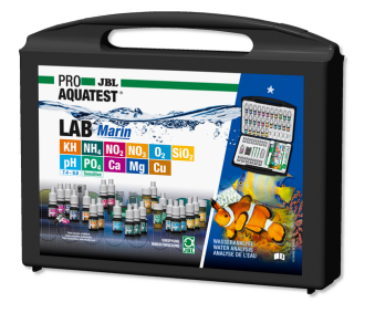
JBL PROAQUATEST LAB Marin

Professional test case for marine water analysis