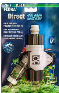
JBL PROFLORA Direct High performance direct diffuser for CO2