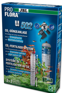
JBL PROFLORA u502 Plant fertiliser system with night switch-off