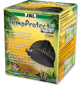
JBL TempProtect II light Reptile thermal burn protection for JBL TempSet items