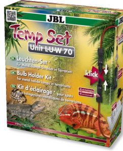
JBL TempSet Unit L-U-W Installation kit for metal-halide lamps