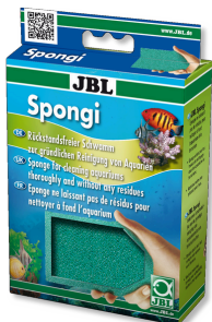
JBL Spongi Cleaning sponge for aquariums and terrariums