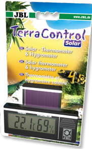
JBL TerraControl Solar Solar-powered thermometer + hygrometer for terrariums