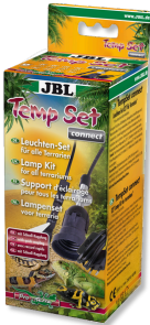
JBL TempSet connect Installation kit with connector