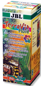
JBL TerraVit fluid Vitamins and trace elements for terrarium animals