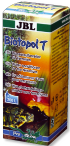
JBL Biotopol T Water conditioner for terrariums