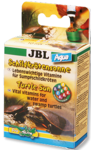
JBL Turtle Sun Aqua Vitamins for turtles and pond terrapins