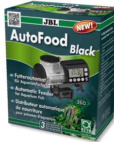
JBL AutoFood BLACK Black automatic feeder for aquarium fish