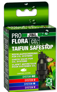
JBL PROFLORA CO2 TAIFUN SAFESTOP Water backflow protection for CO2 systems