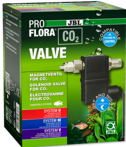
JBL PROFLORA CO2 VALVE CO2 solenoid valve for regulated CO2 addition