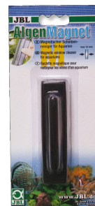
JBL Algae Magnet Magnetic glass cleaner for aquarium panes