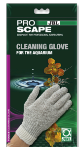
JBL PROSCAPE CLEANING GLOVE Aquarium cleaning glove