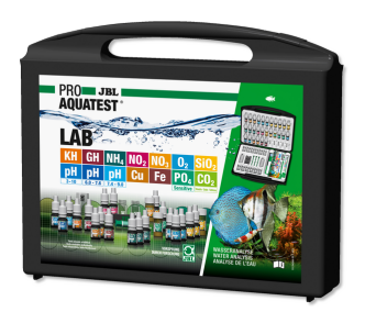
JBL PROAQUATEST LAB Test case with 13 water tests for freshwater analysis