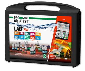
JBL PROAQUATEST LAB Κ̀οί

Test case for water analyses in koi and garden ponds