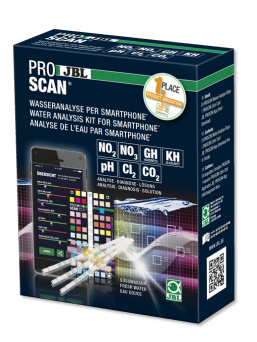
JBL PROSCAN Water test with analysis via smartphone