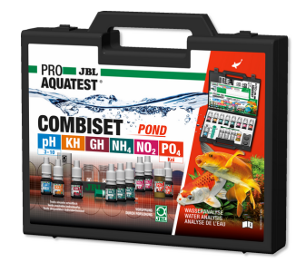
JBL PROAQUATEST COMBISET POND

Test case for water analyses in koi and garden ponds