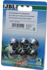
JBL slotted suction cup, 2mm Holder for heating cables in aquariums and terrariums