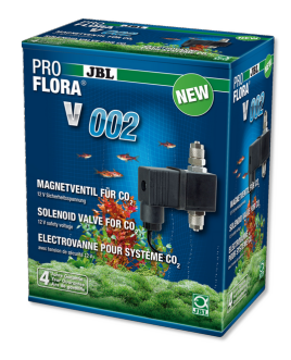
JBL PROFLORA v002 Noiseless solenoid valve