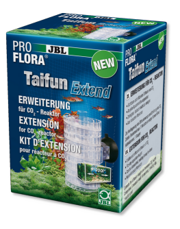
JBL PROFLORA Taifun Extend Extension for CO2 highperformance diffuser