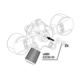
JBL ProFlora "u" flat seal