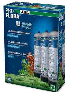
JBL PROFLORA 3 x u500 CO2 disposable storage cylinder