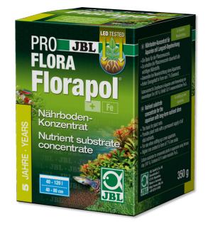
JBL PROFLORA Florapol Long-term nutrient substrate concentrate