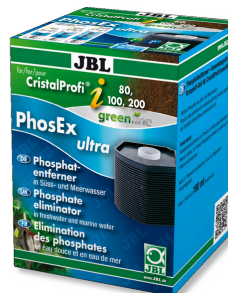
JBL PhosEx Ultra CristalProfi i60/80/100/200 Phosphate remover cartridge for JBL CristalProfi i