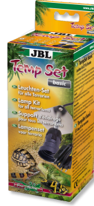
JBL TempSet basic Installation kit for lamps in terrariums