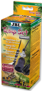
JBL TempSet connect Installation kit with connector