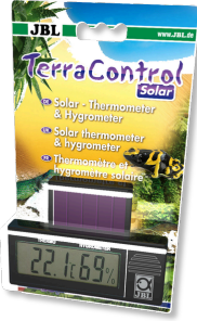
JBL TerraControl Solar Solar-powered thermometer + hygrometer for terrariums