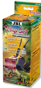
JBL TempSet angle+ connect Installation kit for lamps in terrariums