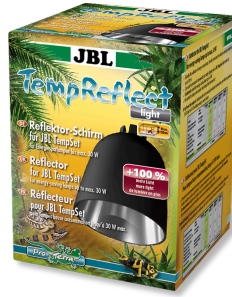
JBL TempReflect light Reflector screen for energy- saving lamps