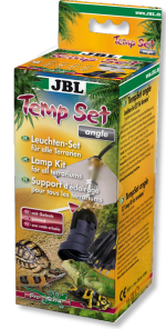
JBL TempSet angle Installation kit for lamps in terrariums