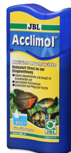
JBL Acclimol Water conditioner for acclimatisation