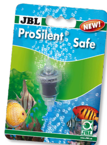
JBL ProSilent Safe