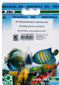
JBL backflow protection