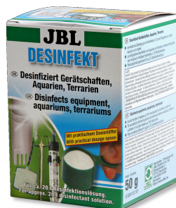
JBL Desinfekt Disinfettante per acquari