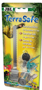
JBL TerraSafe Lock for terrarium pane