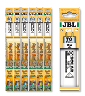
JBL SOLAR REPTIL SUN T8 Special T8 terrarium fluoresc.