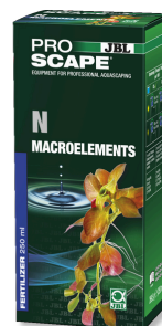
JBL PROSCAPE N MACROELEMENTS Nitrogen plant fertiliser for aquascaping