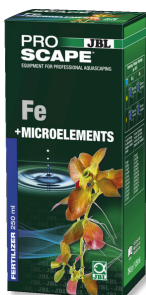
JBL PROSCAPE Fe + MICROELEMENTS Basic plant fertiliser for aquascaping