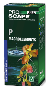
JBL PROSCAPE P MACROELEMENTS Phosphorus plant fertiliser for aquascaping