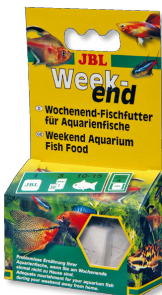
JBL Weekend Weekend complete food for all aquarium fish