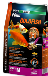
JBL PRO POND GOLDFISH M Food sticks for medium-sized to large goldfish