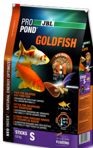
JBL PRO POND GOLDFISH S Food sticks for small goldfish